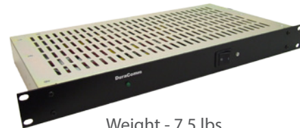
Weight - 7.5 lbs 1.75" H x 19" W x 10.5" D